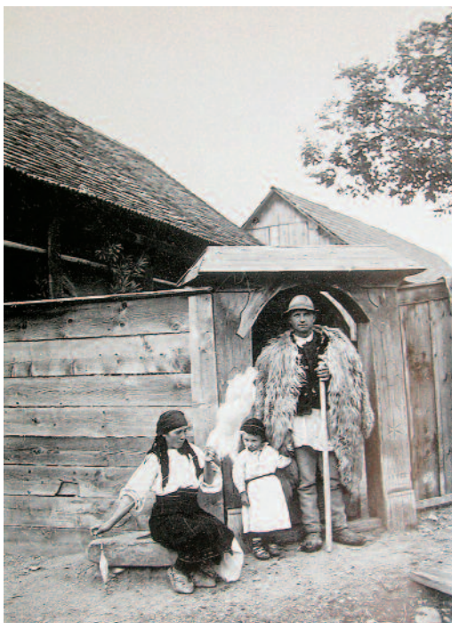
20. Iosif Berman, Peasant family, Drăguș, 1929, 18 x 24,5 cm, Courtesy The Romanian Peasant Museum