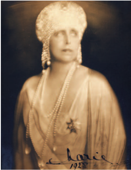
27. Julietta, Queen Marie of Romania, 1928, 46 x 31 cm