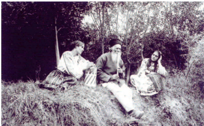
5. Alexandru Bellu, Idyllic composition, postcard, author's collection