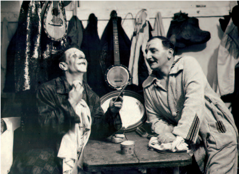
17. Nicolae Ionescu, Clowns preparing for show, Franzini Circus, 1928, 16,5 x 24 cm, Courtesy Library of the Romanian Academy