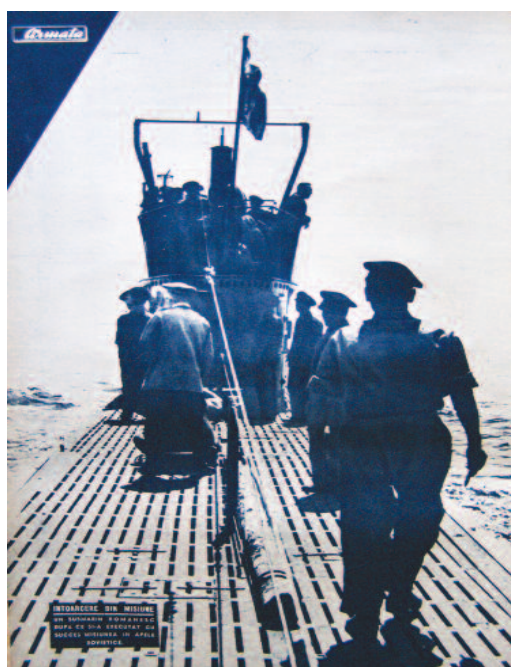
30. Army's Photographic Department, Romanian U-Boat in the Black Sea, „Armata” No.5/15 August 1942