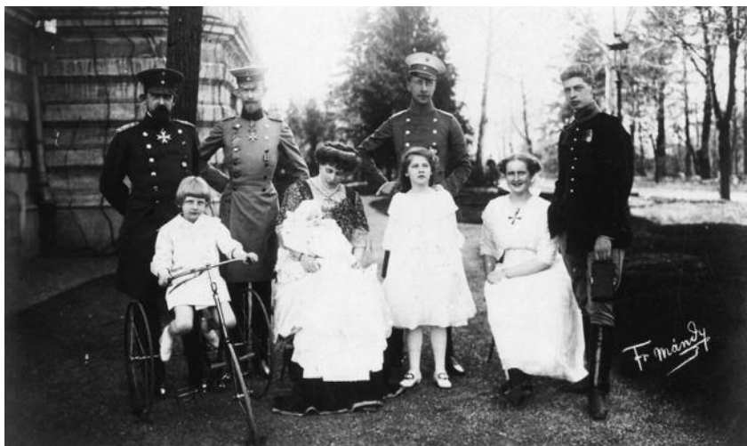
2. Franz Mandy/Et. Lonyai, Romanian Royal Family and the Crown Prince of Germany, 1909, 17 x 23,9 cm, Courtesy Romanian National Library; to be noticed the camera carried by prince Carol (first from right)