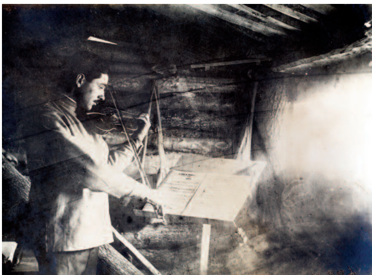
10. The Army's Photographic Department, Playing the violin in trenches, 1917, 16,5 x 21,5 cm, Courtesy The National Military Museum