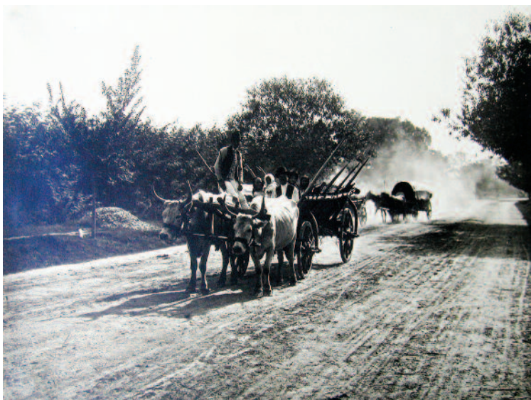
8. Gheorghe Capșa, Returning from fair, 17 x 22 cm, author's collection