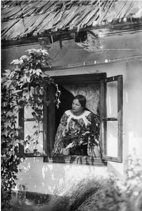
23. Adolph Chevallier, Young peasant woman at the window, Neamț County, 15 x 9,9 cm, Courtesy The Ethnographic Museum, Piatra Neamț