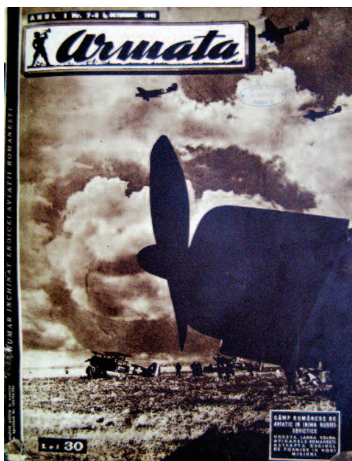
32. Army's Photographic Department, Romanian planes, „Armata” No. 7-8/4 October 1942