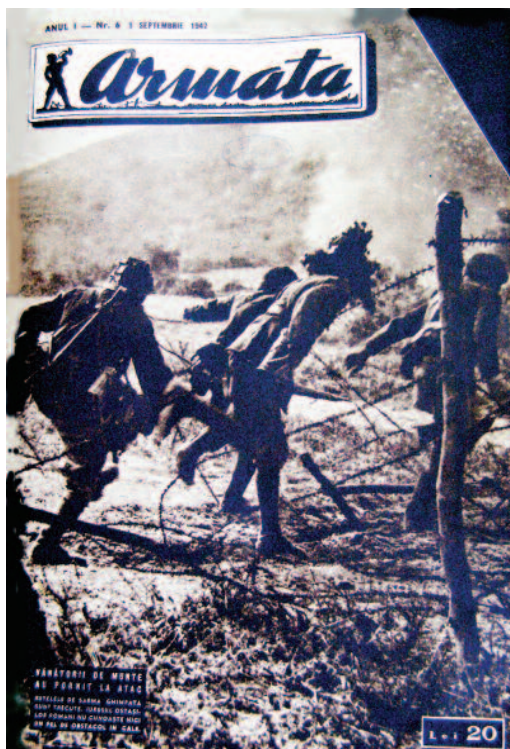
31. Army's Photographic Department, Rifle troops attacking, „Armata” No.6/1 September 1942