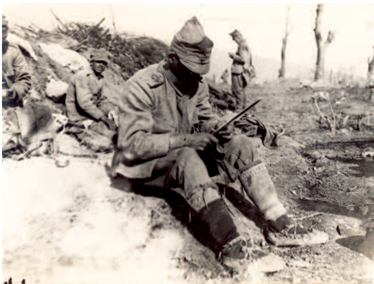
9. The Army's Photographic Department, Romanian infantryman greasing his bayonet, 1917, 16,5 x 21,5 cm, Courtesy The National Military Museum