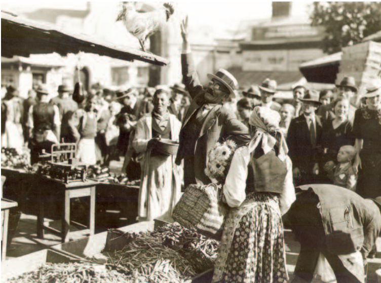
12. Nicolae Ionescu, Market , 1917, 8 x 24 cm, Courtesy Library of the Romanian Academy