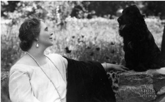
4. Queen Marie and her dog, Crag, 1926, postcard