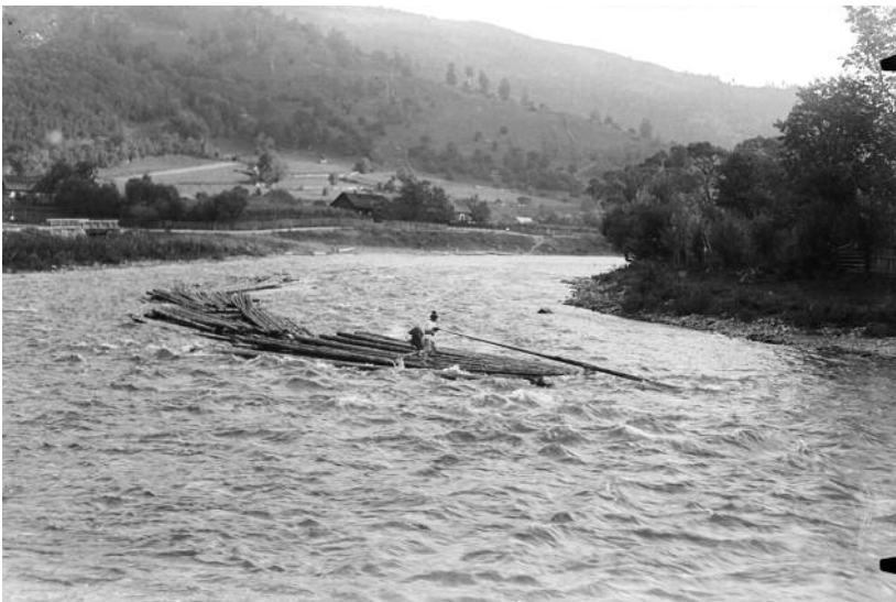
24. Adolph Chevallier, Rafts on Bistrița River, 9,9 x 15 cm, Courtesy The Ethnographic Museum, Piatra Neamț