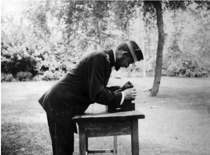
3. Princess Marie, Prince Ferdinand taking pictures, c. 1910, 9 x 14 cm, private collection