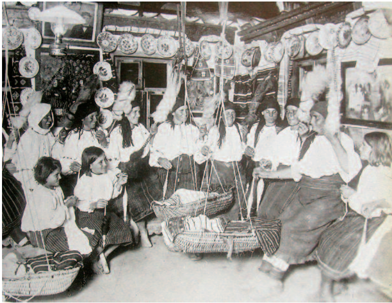
21. Iosif Berman, Bee in Drăguș, 1929, 18 x 24, 5 cm