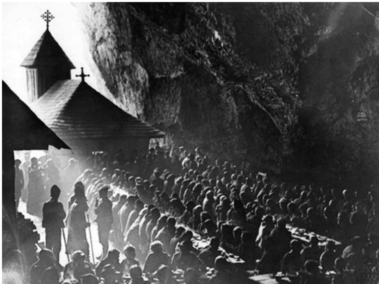
18. Iosif Berman, Feast at a monastery, 15 x 23 cm