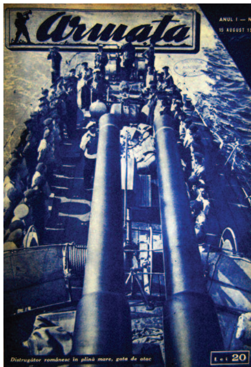
29. Army's Photographic Department, Romanian Destroyer in the Black Sea, „Armata” No.5/15 August 1942