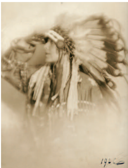
26. Julietta, Queen Marie as Morning Star, Honorary Chieftain of the Blackfoot Indians, 1926, 45 x 35 cm, Courtesy National Peleş Museum, Sinaia