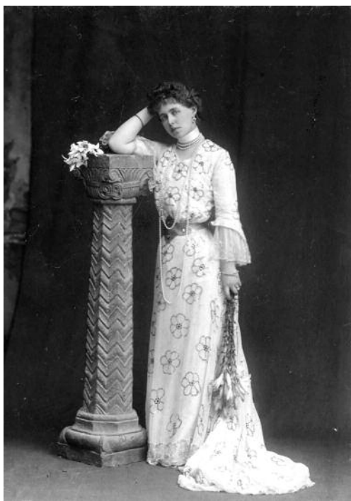
1. Franz Mandy, Princess Marie, 29 x 22,5 cm